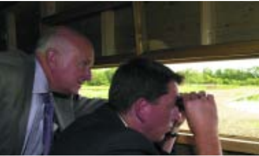
The bird hide at Testwood Lakes

LINKS: www.btcv.org | www.bto.org | www.butterfly-conservation.org |