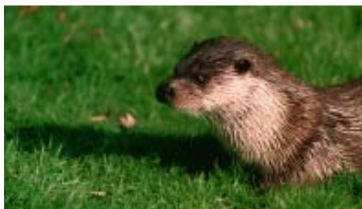
We have developed an action plan for the otter

To achieve the public service agreement target, we undertook an assessment of the estimated costs to bring our land into favourable condition, and this has been incorporated into our business plan for 2005-2010. An English Nature survey estimated that 72.8% of our land holdings are in favourable or recovering condition, so approximately 27.2% will require additional conservation management to bring it back to favourable status. We are looking to verify this estimate of SSSI conservation status by carrying out ecological surveys to investigate the nature conservation interest on our sites next year.