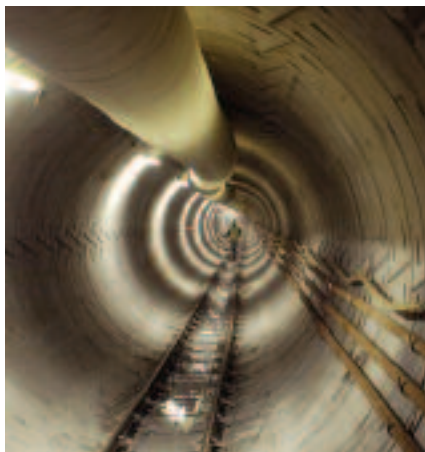
Light at the end of the tunnel as work continues

To date, seven Forum group meetings have been held where members of the project team from Southern Water and the contractor meet with representatives from the local community to provide updates on the scheme and address any concerns they may have.