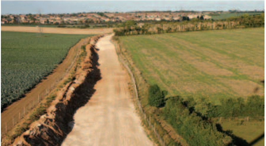
A path to cleaner seas

Work is progressing well on Southern Water's £80 million environmental improvement scheme to bring even cleaner seas to Margate and Broadstairs in line with UK and European Legislation.