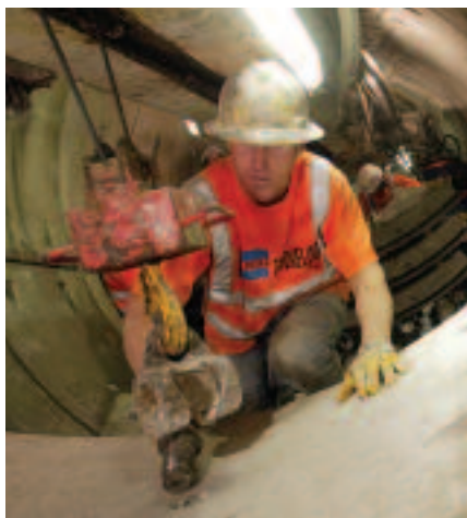
Piecing together tunnel jigsaw

plinths are currently being constructed and the installation of the ductile iron pipes will follow within the next month.