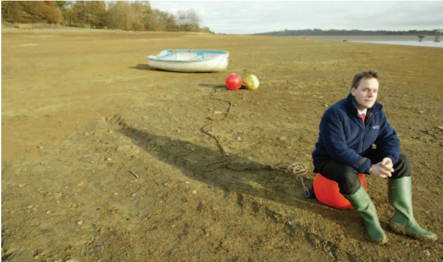
Bewl Reservoir in Kent during the drought of 2004-2006