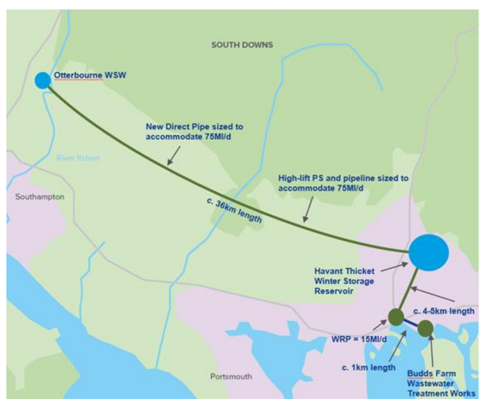
Figure 4 - Schematic of Option B.4

Option B.4 consists of exactly the same infrastructure as Option D.2, plus a WRP producing 15 Ml/d located near Budds Farm Wastewater Treatment Works (WTW), with associated transfer pipelines between Budds Farm WTW, the WRP and Havant Thicket reservoir. An overall transfer capacity of 75 Ml/d is provided.