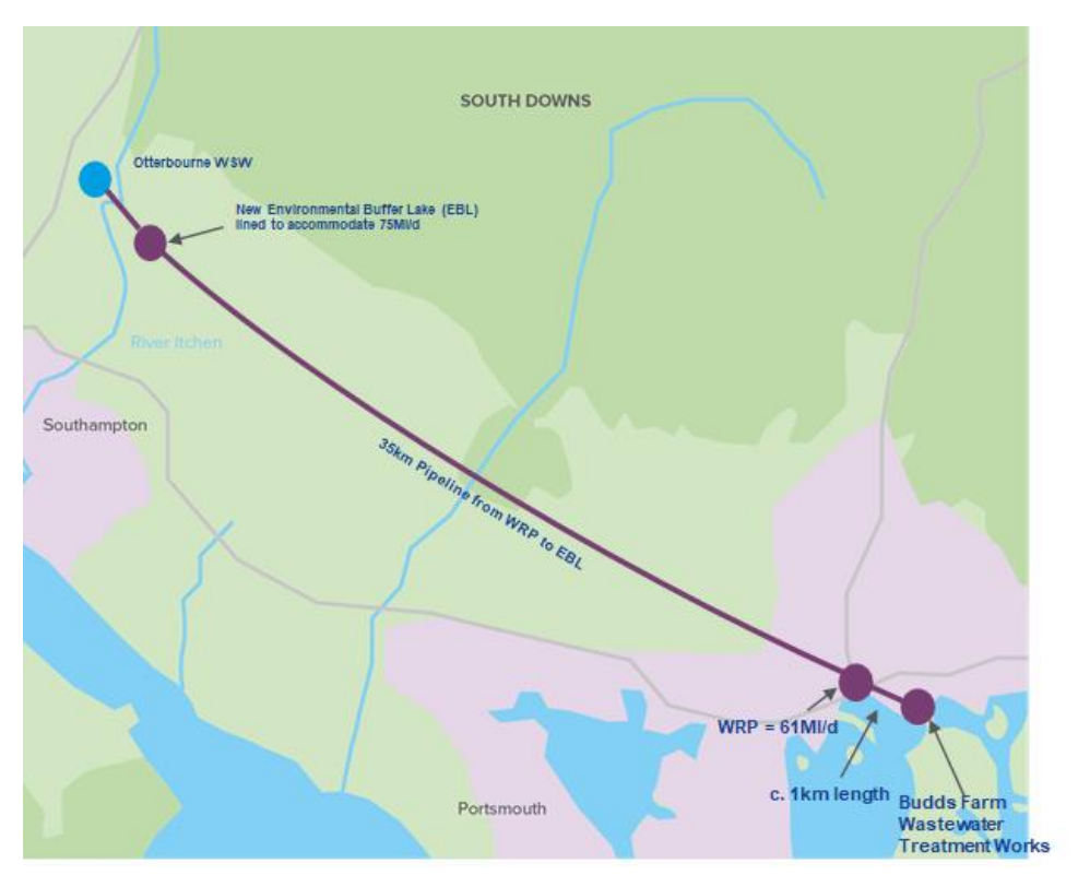
Figure 1 - Schematic of Option B.2