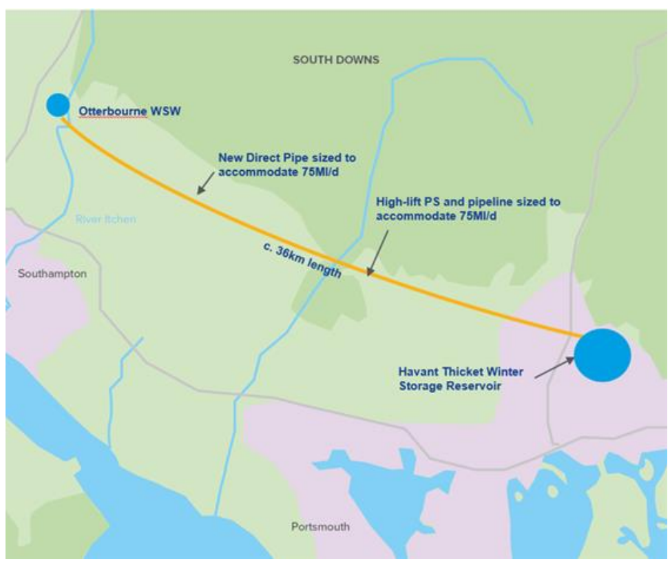
Figure 2 - Schematic of Option D.2

Option D.2 provides a direct raw water transfer from Havant Thicket reservoir up to a peak capacity of 61 Ml/d via a new proposed c. 35km 800mm pipeline to Otterbourne Water Supply Works (WSW). Raw water will be abstracted from the reservoir and lifted via a high-lift pumping station to Otterbourne WSW. Subject to the final pipeline route, topography and hydraulics, a further booster station and break tank may be necessary part way along the route. Option D.2 already includes a pipeline and pumping station sized to accommodate up to a 75 Ml/d transfer.