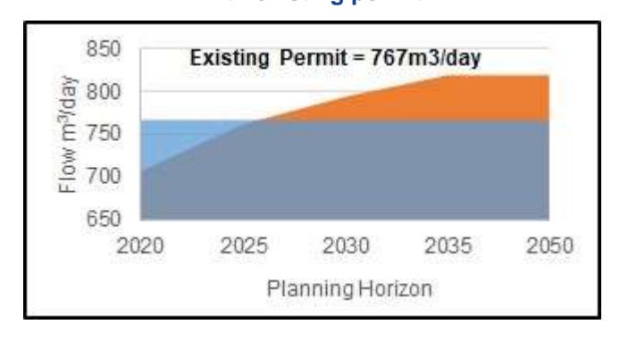
Figure 3: Recorded and predicted dry weather flow with existing permit

The primary driver is 'Quality' due to the permit and capacity at the treatment work.