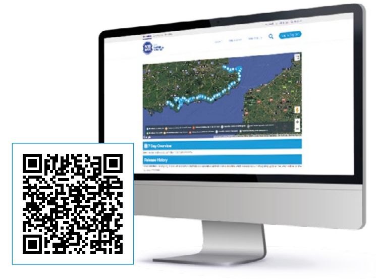
▲ Beachbuoy, our near real-time storm overflow activity tool

Most storm releases are heavily diluted wastewater – up to 95% is rainwater. Storm overflows are not manually operated, they work automatically to release excess water, for example after heavy rain has filled the sewers. These releases are permitted by law and we report all spills to the Environment Agency. Our industry is heavily regulated by the Environment Agency, which sets the permits on storm overflows.