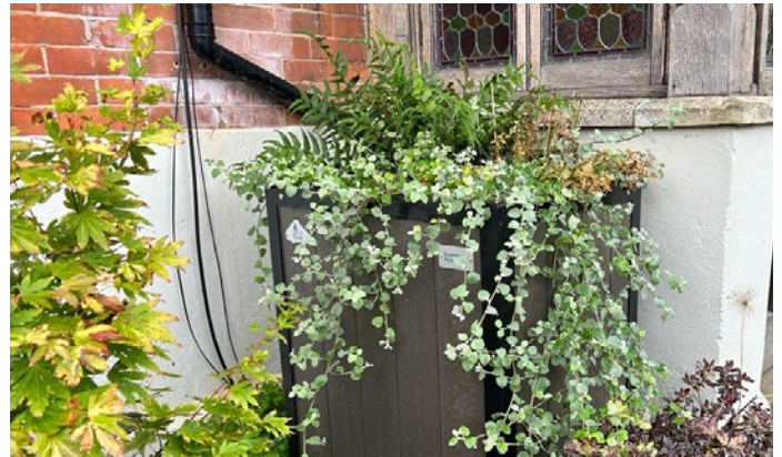
▲ You can help reduce storm overflows, find out how

Speak up about green spaces: Encourage local councillors and authorities to make these drainage solutions part of their plans.