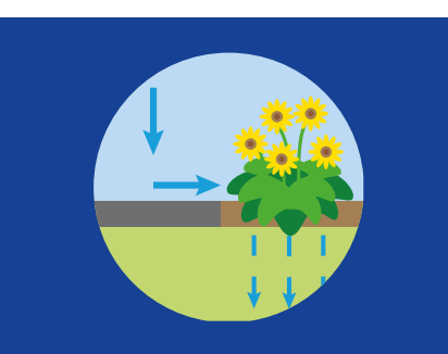
Need to park off road? Make sure your driveway runs off into a flower bed or patch of grass rather than a drain.