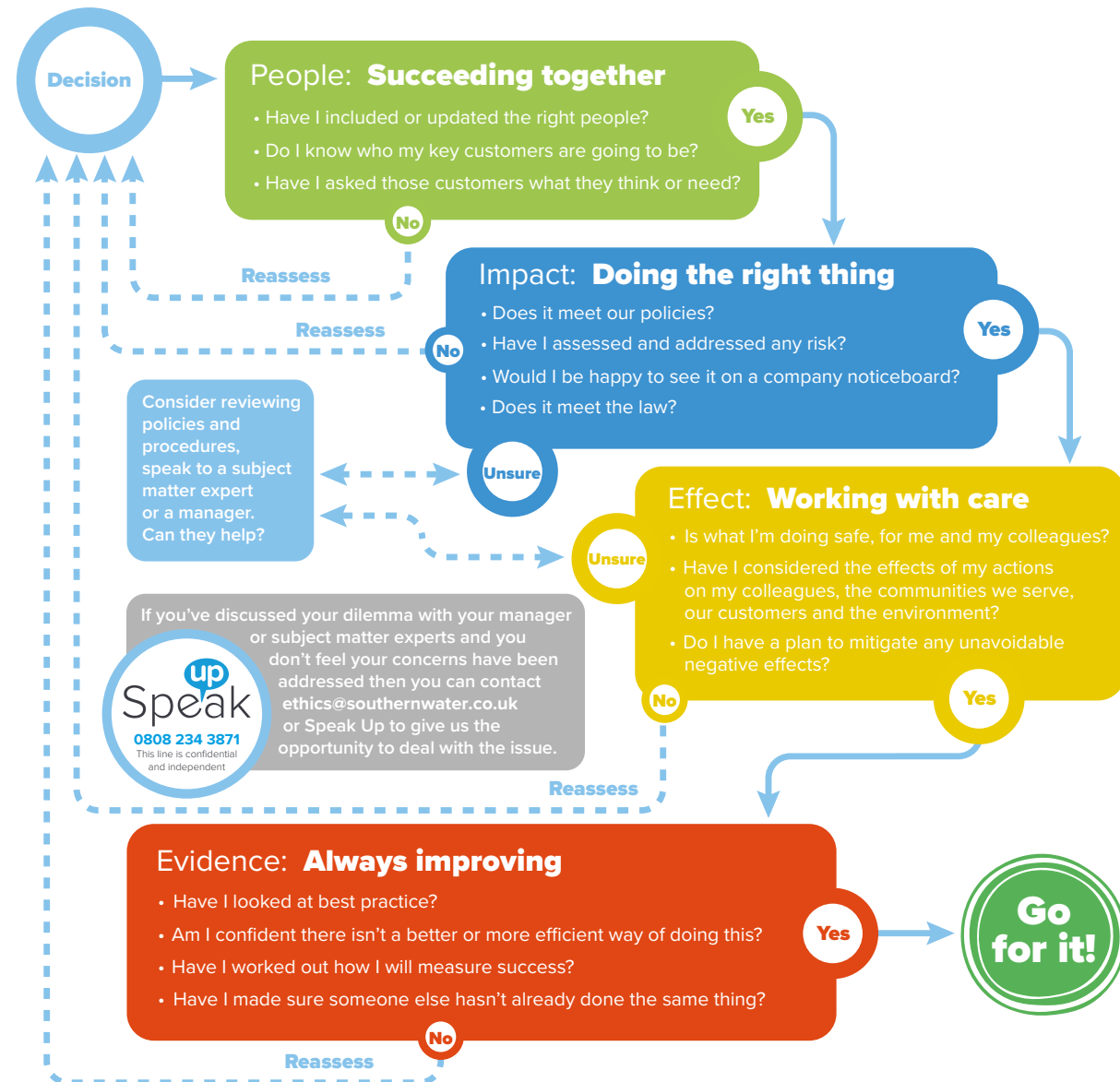
Figure 1: Quick Check Decision Making Tool To help all of us make better decisions, use this quick check.

We often experience ethical dilemmas in our everyday lives. Think about the following scenario. What would you do if it was you? You are parking the car and when getting out the door knocks into the car next door. You don't know if anyone has seen this and the extent of the damage. Do you ignore the situation and carry on with your day, leave a message on the other car's windscreen or attempt to contact the owner. How might you feel if you were the owner of the other car?