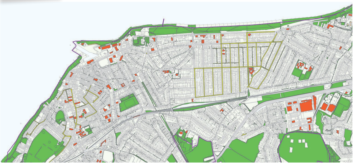
Impermeable area opportunities

The full technical report sets out types of interventions that could be implemented to reduce storm releases in Swalecliffe (Whitstable). While some actions can be put in place immediately, some will require design and procurement time or trialing. Residents should expect to see early interventions autumn 2022, with regular progress updates posted on our website.