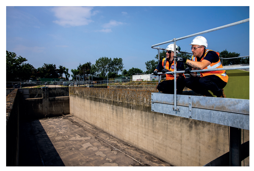
Swalecliffe Wastewater Treatment Works

Due to the nature of the drainage system in Swalecliffe (Whitstable), we are exploring a mix of interventions to reduce storm releases. These include improvements to our Wastewater Treatment Works, optimisation of pumping stations in the catchment, identification and removal of surface water pipes that have been misconnected into the combined sewer, and removal of impermeable land where rainfall runoffs into the combined system.