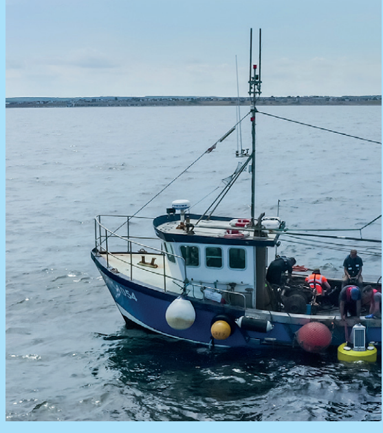
Water quality testing buoy aunched offshore at Tankerton

If you have any questions or want to get in touch, please email: nicole.mcnab@southernwater.co.uk